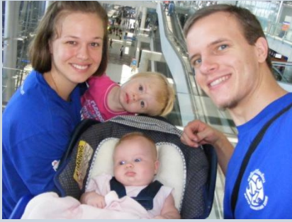
At the airport in Bangkok (above); Prayers for our departure from Thailand