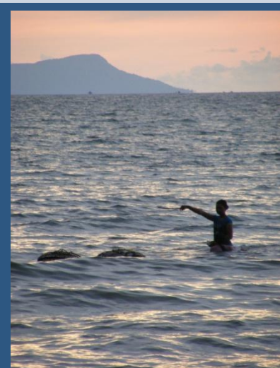
Woman fishing in southern Cambodia where we visited with the Hayeses